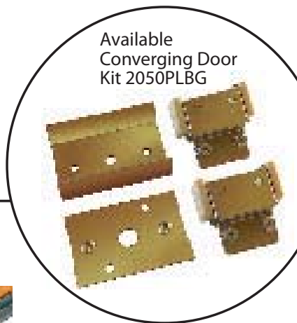
Available Converging Door Kit 2050PLBG

Jamb Mount Door Guide Set Molded nylon guides hold door in place and ensure smooth operation.